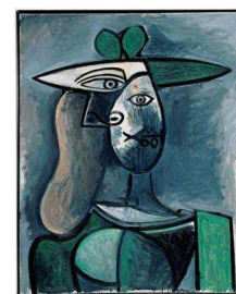
Pablo Picasso Woman with a green hat, 1947 Albertina, Vienna – Batliner Collection