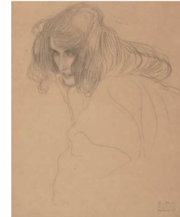
Gustav Klimt Studie eines Frauenkopfes im Dreiviertelprofil (Study of a Woman's Head in Three-Quarter Profile) for the "Unchastity" allegory in the "Beethoven Frieze", 1901-1902 Albertina, Vienna