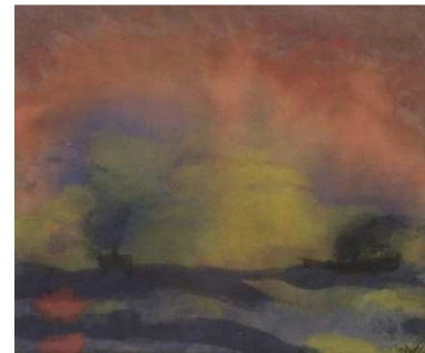
Emil Nolde Zwei Dampfer (Two Steamships), around 1915 Watercolour on Japan paper Albertina, Vienna – permanent loan from the Werner collection