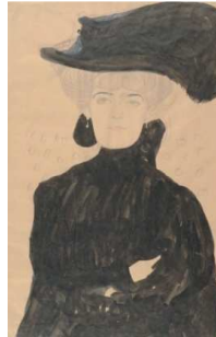
Gustav Klimt Halbbildnis einer Dame in Schwarz mit Federhut (Semi-Portrait of a Lady with Plume Hat), 1907-08 Brush, pen, India ink, pencil, red pencil crayon Albertina, Vienna