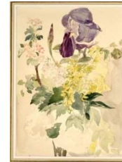
Edouard Manet Study of Flowers, 1880 Watercolour