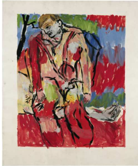
Georg Baselitz, Ornamentale (Remix), 2005, Oil on Canvas, Albertina, Vienna – On permanent loan from the Rheingold Collection

This exhibition will present the latest accessions of the Albertina in the area of Contemporary Art. These will stand in contrast to a selection of important artwork after 1970 from the already existing collections. This will allow the visitor to gain insight into the manifold and extensive holdings of the collection.