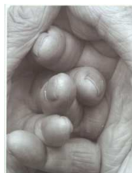
John Coplans Interlocking Fingers No. 17, 2000 Silbergelatinepapier Albertina, Wien