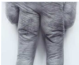
John Coplans Self Portrait Interlocking Fingers No 6, 1999 Silbergelatinepapier Albertina, Wien

The body also features prominently in the work of other artists such as Hannah Wilke, Ketty La Rocca, Hannah Villiger, Bruce Nauman, Robert Mapplethorpe, and Tatiana Lecomte. These positions not only emphasize crucial dimensions of Coplans's oeuvre, but also convey a diversified impression of the critical representation of the human body since 1970.