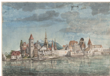
Albrecht Dürer Innsbruck von Norden (Innsbruck from the North), around 1496 Watercolour, traces of opaque paint, accented with covering white Albertina, Vienna

Many of the most important works created for the propaganda and in memory of Maximilian I are found in the Albertina. These include works of Albrecht Dürer, but also the extraordinary Triumphal Procession of Albrecht Altdorfer and his workshop, which will form the core of the exhibit. Of the original 109 large format parchment sheets with flamboyantly colourful representations of riders, magnificent wagons and landsknechts, sheets 49 to 109 remain in the Albertina and, compiled as a frieze, amount to a length of more than 54 metres. In addition to this unique work, other important imperial commissions are presented, such as the monumental woodcut Triumphal Arch and the book projects Theuerdank , Weißkunig and Freydal , which are very closely intertwined with one another in terms of form and ideas. Emperor Maximilian I has been called the "Last Knight" since the 19 th century, although he stood at the beginning of a Europe-wide renaissance of chivalry represented in the form of magnificent tournaments and armaments. In addition to many other themes, the exhibition presents this illustrious aspect of the art from the time of Maximilian with numerous examples from the internal collection, complemented by important loans from international museums such as the Metropolitan Museum of Art New York, the Berlin Kupferstichkabinett (Museum of Prints and Drawings) and the Kunsthistorisches Museum (Museum of Art History) Vienna.