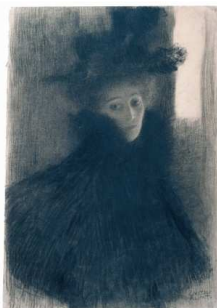
Gustav Klimt Bildnis einer Dame mit Cape und Hut im Dreiviertelprofil (Portrait of a Lady with Cape and Hat in Three-Quarter Profile), 1897-1898 Black and red chalk Albertina, Vienna

Particularly these rarely shown series convey deep insight into the work methods and the mental and emotional universe of an artist who practically never spoke about his art.