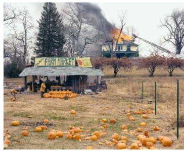
Joel Sternfeld McLean, Virginia, December 1978 from the series: American Prospects Digital C-print © Courtesy of the artist and Luhring Augustine, New York, 2011

© Courtesy of the artist and Luhring Augustine, New York, 2011