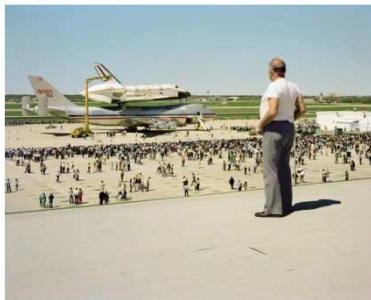
Joel Sternfeld The Space Shuttle Columbia Lands at Kelly Lackland Air Force Base, San Antonio, Texas, March 1979 from the series: American Prospects Digital C-print

The Albertina, in cooperation with the Museum Folkwang, Essen is dedicating a retrospective to the American photographer Joel Sternfeld (*1944, New York), which will show around 130 works from more than three decades of artistic activity. Joel Sternfeld is among the most important representatives of New Color Photography , which discovered colour for artistic photography in the 1970's. A total of eleven projects is being presented under the title Joel Sternfeld – Colour photography since 1970 . One area of focus is thereby on 50 photographs from his to date unpublished early work, which extends from 1969 into the late 1970's. Sternfeld's view is always oriented to his homeland of America, with its idiosyncrasies, the people and its specific landscapes. The distanced perspective of the artist with reference to the country and its inhabitants results in emphatic images that show an America between utopia and dystopia.