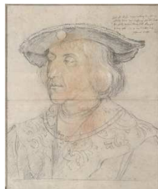
Albrecht Dürer Emperor Maximilian I, 1518 Black chalk, coloured chalk, accented with white chalk Albertina, Vienna