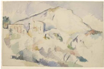
Paul Cézanne The Château Noir with Mont Sainte-Victoire, 1890-95 Watercolour over pencil

While the paintings of Monet, Degas, Renoir, Pissarro, Manet, Seurat, Signac, Cézanne and Gauguin enjoy great popularity, their at least as impressive work on paper is much less well-known. It was thanks to these artists in particular that the drawing, in addition to its mainly secondary usage as preparatory study material, also received a primary function and was able to redefine itself as a complete, independent work of art.