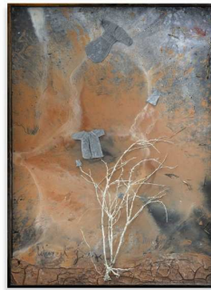
Anselm Kiefer, Wurzel Jesse, 2008, Albertina, Vienna – Batliner Collection