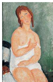
Amedeo Modigliani Young Woman in a Chemise, 1918 Albertina, Vienna – Batliner Collection