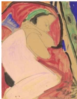
Erich Heckel Schlafendes Mädchen (Sleeping Girl), 1912 Pencil and watercolour on cardboard Albertina, Vienna – permanent loan from the Werner collection