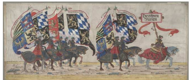
Albrecht Altdorfer Die deutschen Fürsten (The German Princes), around 1513-16 Pen with brown ink, watercolour and opaque paints, gold elevations, on parchment Albertina, Vienna