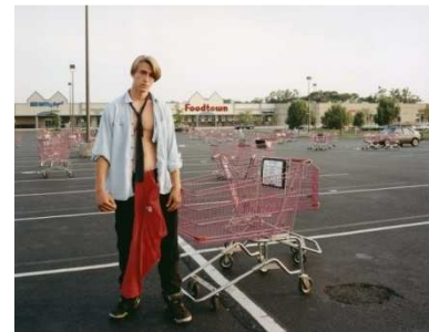
Joel Sternfeld Young Man Gathering Shopping Carts, Huntington, New York, July 1993 from the series: Stranger Passing C-print