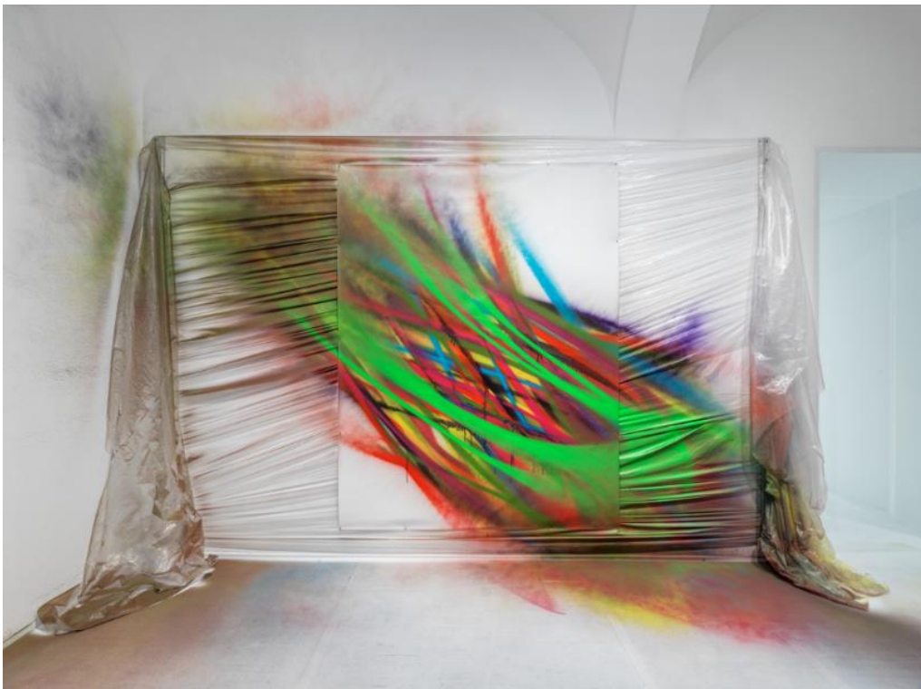
Katharina Grosse. Why Three Tones Do Not Form A Triangle, 2023 ALBERTINA, Vienna (01.11.2023–01.4.2024), Exhibition view