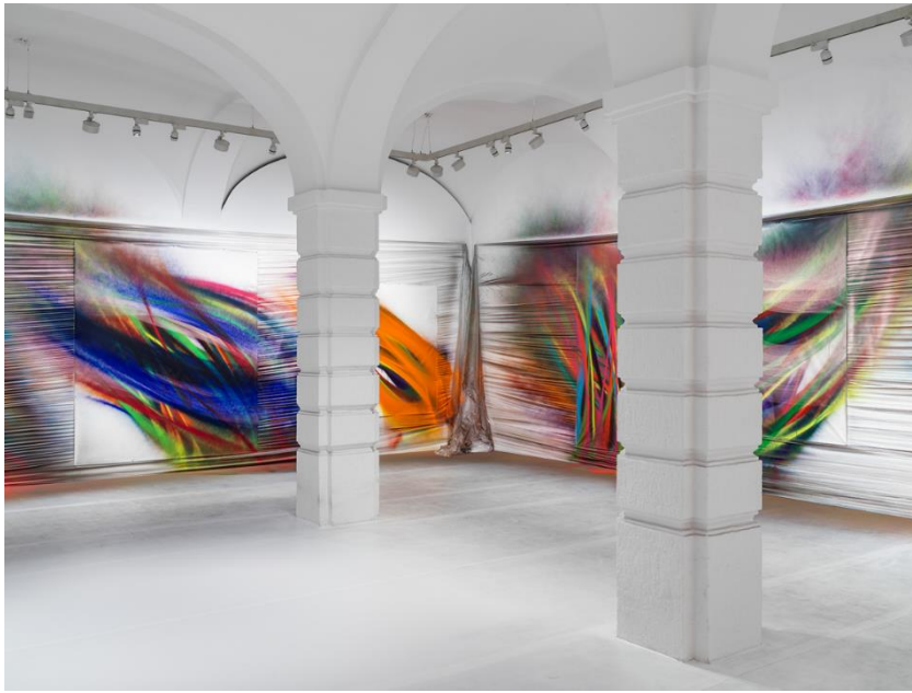
Katharina Grosse. Why Three Tones Do Not Form A Triangle, 2023 ALBERTINA, Vienna (01.11.2023–01.4.2024), Exhibition view