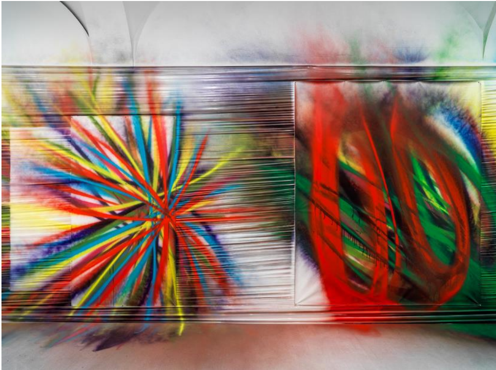
Katharina Grosse. Why Three Tones Do Not Form A Triangle, 2023 ALBERTINA, Vienna (01.11.2023–01.4.2024), Exhibition view