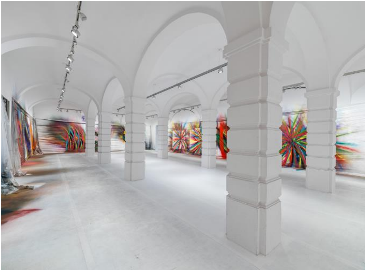
Katharina Grosse. Why Three Tones Do Not Form A Triangle, 2023 ALBERTINA, Vienna (01.11.2023–01.4.2024), Exhibition view

The following images are available free of charge in the Press section of www.albertina.at . Legal notice: The images may only be used in connection with reporting on the exhibition.