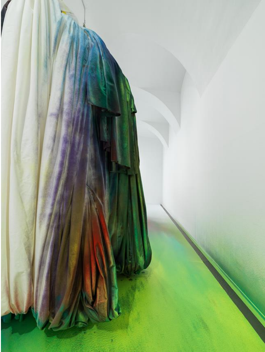
Katharina Grosse. Why Three Tones Do Not Form A Triangle, 2023 ALBERTINA, Vienna (01.11.2023–01.4.2024), Exhibition view