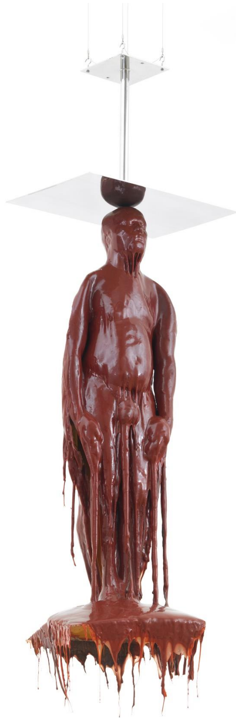
Marc Quinn Stripped (Red) , 1997 Polyurethane and stainless steel 240 × 45 × 60 cm The ALBERTINA Museum, Vienna – The ESSL Collection