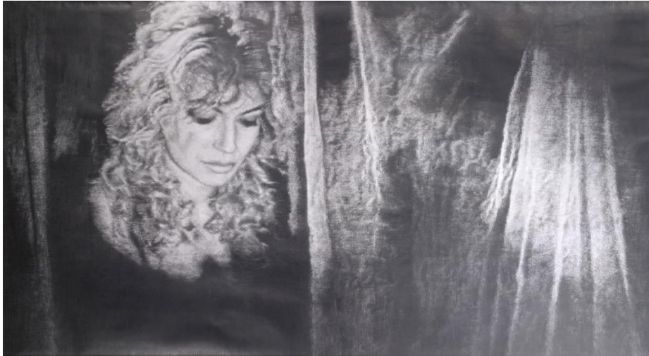
Sonja Gangl The End_11111 , 2008 Pencil 150 x 270 cm The ALBERTINA Museum, Vienna