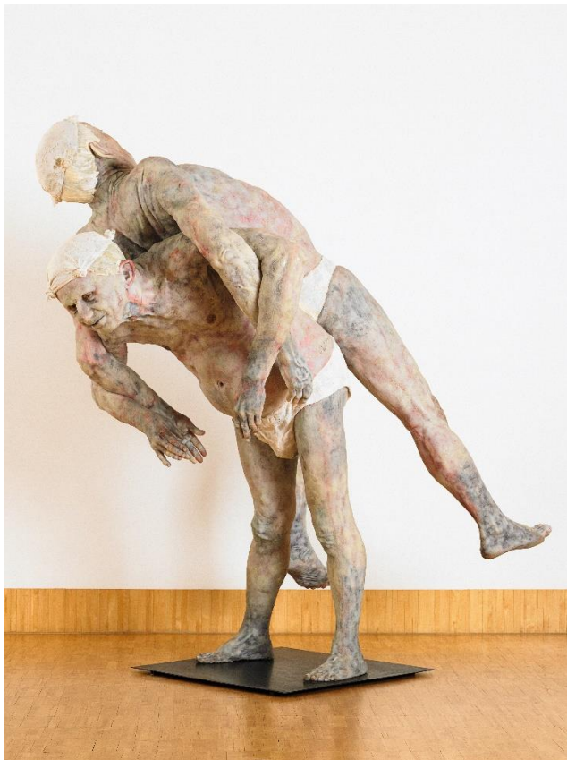
Virgilius Moldovan The Popes (Healing Acrobatics) , 2008 Silicone, pigments, epoxy resin, shaped tubes 250 x 150 x 250 cm The ALBERTINA Museum, Vienna – The ESSL Collection