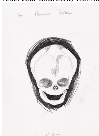
Damien Hirst For Heaven's Sake Drawing I, 2008