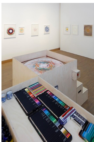
Installation view, Damien Hirst: Drawings at Albertina Modern, Vienna, 7 May - 12 October 2025. © Damien Hirst and Science Ltd. All rights reserved, DACS 2025.

Legal notice: The images may only be used in connection with reporting on the exhibition.