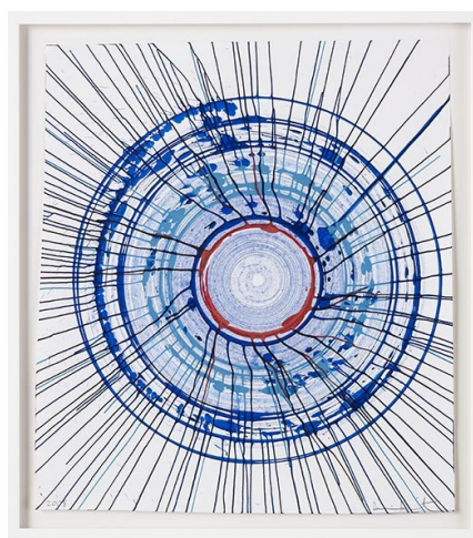
Damien Hirst Beautiful Temporarily Lost At Sea Drawing, 2008 Pastel and ink on paper 47 × 42 cm © Damien Hirst and Science Ltd. All rights reserved/ Bildrecht, Vienna 2025