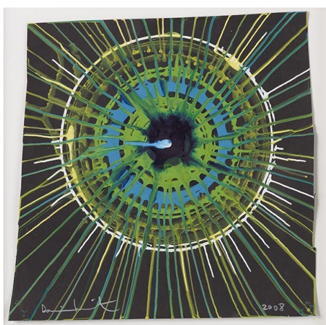
Damien Hirst Beautiful That's No Immaculate Conception