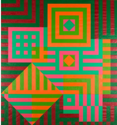
Victor Vasarely Kiu-Siu, 1963 Oil on canvas 214 x 202 cm The ALBERTINA Museum, Vienna – The ESSL Collection

Legal notice: The images may only be used in connection with reporting on the exhibition.